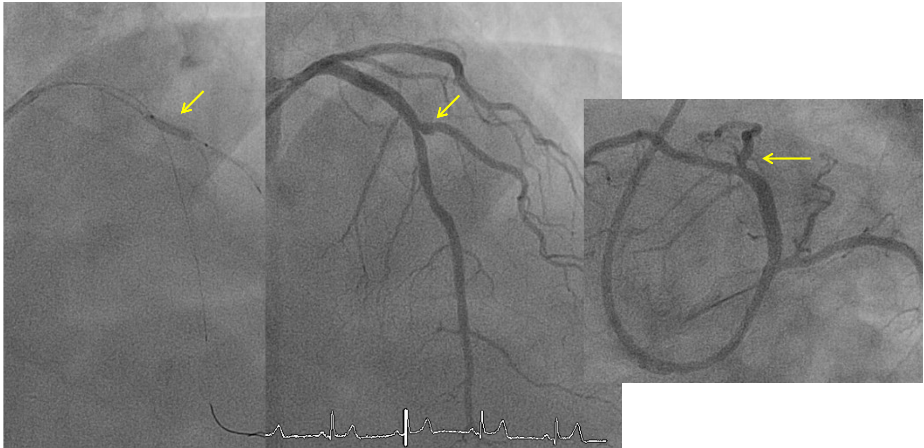
Dior Balloon Angioplasty & Immediate results